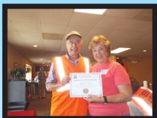
DIPLOMA FOR EACH STUDENT